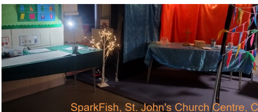
SparkFish, St. John's Church Centre, Church Road, Redhill, Surrey, RH1 5QA